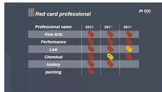
Fig. 6. Professionals in need of warning.

In the long run, if college education does not take corresponding measures, then the mission of building the motherland of talent education will not be reasonable and practical implementation. In some foreign classrooms often have animation company professionals to teach, students in the study and after-school has tried to simulate the