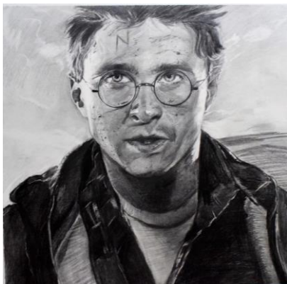
Fig. 3. Fine sketch.

As a design professional sketch should be bold innovation and attempt, highlighting the characteristics of animation professional sketch, adapt to market demand, if still face with high school is the same as the classroom exercises and after-school homework, then students must be no fresh ness and easy to slack off. When the teaching arrangement is well-designed, fully grasp the students' interest points, in the classroom to arrange some students are interested in the proposition, such as in fine sketching can produce a series of sci-fi topics, practice homework to do a variety of considerations, such as the human body structure, the original artist's work. After the class organizing a small exhibition and encouraging students, the effect is good. Fine sketching, for example, can train students to develop deep skills and material performance methods, and so on. Here, students draw their interest in the Harry Potter series of the main characters of the fine sketch, and after the class, they make a collective exhibition, and the effect is very good (see "Fig. 3" and "Fig. 4").