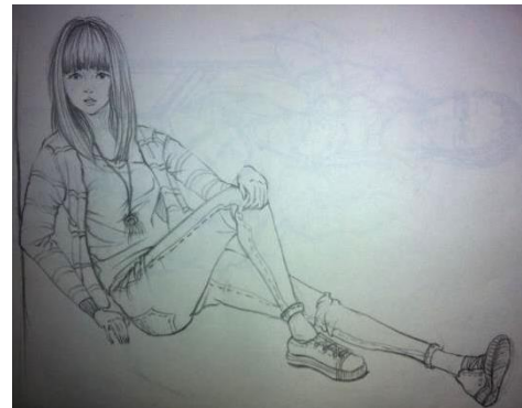
Fig. 2. Sketch of a character drawn by a student.

Animation professional sketch is inseparable from the speed of writing, although the sketch is a sketch that is faster. For animation students, sketching is not to be ignored; sketching needs continuous training, students' mastery of the lines and the dynamic performance of characters is of great help. When the sketch design course, the students' imagination and design concept is a test of the combination of hand and brain, think may not be able to show, sketch bottom thick but conservative old. At this time, it is necessary to do more in line with the needs of animation professional training. The foundation of animation major can not be separated from the short handicap practice, the character shaping and the drawing of the action trajectory, so it is very necessary for the animation students' sketch training. It can be either a quick-brush sketch or a well-structured work [1]. Students can incorporate elements specifically to the animation profession in sketch training. For example, and when students turn traditional character sketches into secondary meta, the details of the characters should be relatively simplified and incorporated into the drawing techniques unique to the secondary meta, etc. (see "Fig. 2").