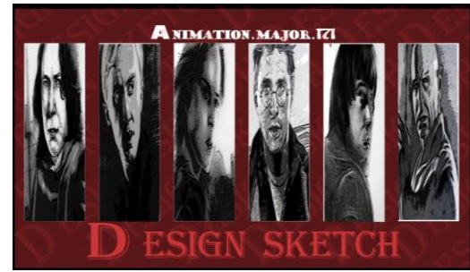
Fig. 4. Exhibition posters for fine sketches.