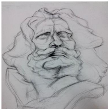
Fig. 1. Structural sketches of student paintings.