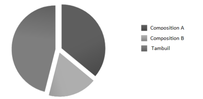
Fig. 1. Diagram of comparison of the amount of carotenoids in the compositions.

The ability to optimize the process of peloid extraction from the Tambukan mud by the ultrasound-assisted extraction has been proven. Offered method for extraction and determination of carotenoid amount in Tambukan mud is less resource- and energy-demanding.