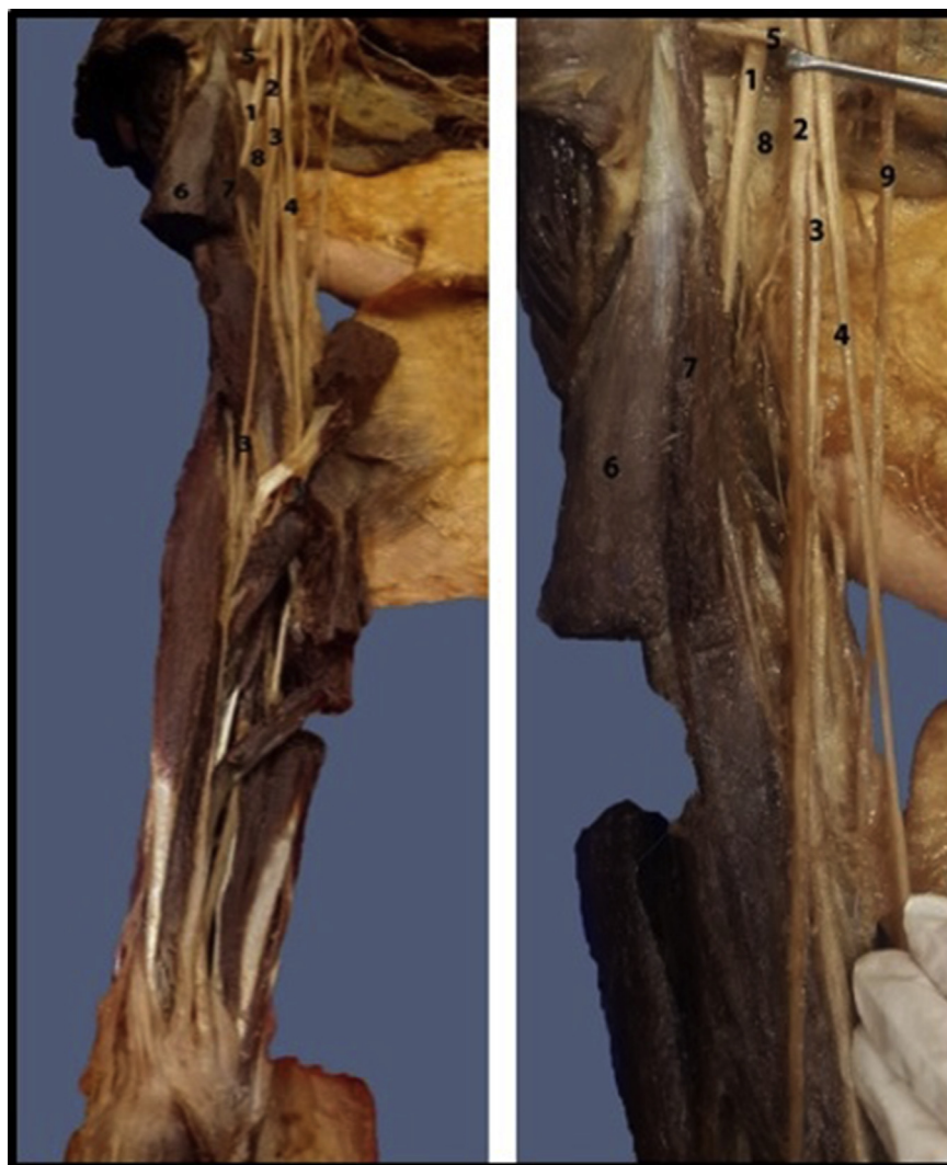
Figure 1 a, b. Cadaveric appearance of the high origin of radial artery from the axillary artery. Abbreviations. 1: Musculo-cutaneous nerve 2: Axillary nerve 3: Radial artery 4: Median nerve 5: Anterior circumflex humeral artery 6: Biceps brachii muscle 7: Long head of the biceps brachii muscle 8: Teres major 9: Medial cutaneous nerve of arm/forearm.

bifurcates into the radial and ulnar arteries at the elbow region. Anatomical variations of this artery occur in almost 20% of the cases and are commonly found in routine dissections or in clinical practice. 2,3 Six different variations have been identified so far, with the brachial artery following a superficial course (superficial brachial artery) being the most common, whereas the existence of a doubled brachial artery, or a high origin of the radial artery (brachioradial artery) is rarer. 1,4 The brachial artery may be absent in rare cases (accessory brachial artery), 5 may be divided at a higher level, 6 it may trifurcate 7,8 or there may be accessory branches that may or may not bifurcate into radial and ulnar arteries. 9 Being aware of vascular variations is important for both surgeons and radiologists, and may prevent diagnostic errors. 10