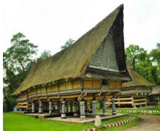
Figure 21 Traditional House of North Sumatera

ancestors. The traditional house introduced to the students is traditional house of Central Java named Joglo (Figure 23), traditional house of North Sumatera named Bolon (Figure 21), traditional house of West Sumatera named Gadang (Figure 22), traditional house of Nangroe Aceh Darusalam named Krong Bade, traditional house of Bangka Belitung named Limas, traditional house of West Java named Sunda, traditional house of DKI Jakarta named Kebaya, traditional house of DI Jogyaakarta named Bangsal Kencono, traditional house of Bali named Gampura Candi Bentar, traditional house of Central Kalimantan named Betang, traditional house of North Sulawesi named Pewaris.