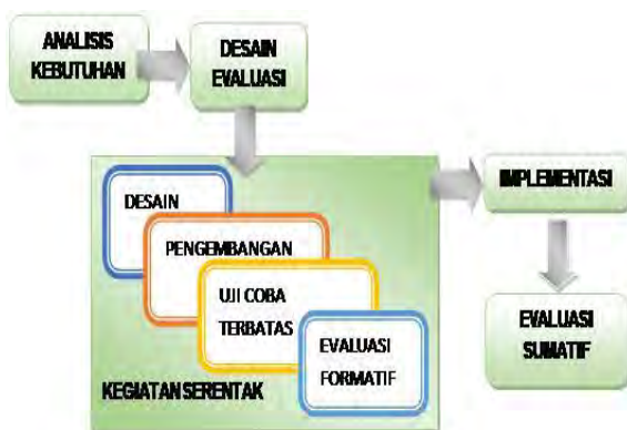
Figure 2 Learning Development Model (Davidson-Shivers and Rasmussen, 2006)

Analysis. The analysis process includes 4 steps, namely: (1) Audience Analysis (teacher), this analysis describes the student's target, this analysis provides a description in the context of the student population; (2) technology and media analysis, technology analysis describes the technology for developing management systems for reverse pedagogical models which are technologies related to hardware, software and their interconnections, analysis of media described in the media used in learning. Description includes learning objects based on text, image, audio, video and web; (3) situation analysis, this analysis describes which environment, this flip pedagogy model will be implemented and the characteristics of the learning environment itself; and (4) objective analysis (content), this analysis describes learning objects that will be used in flip pedagogy models.