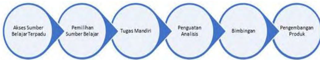
Figure 3 Self-Concept Strengthening Learning Design Access Learning Resources