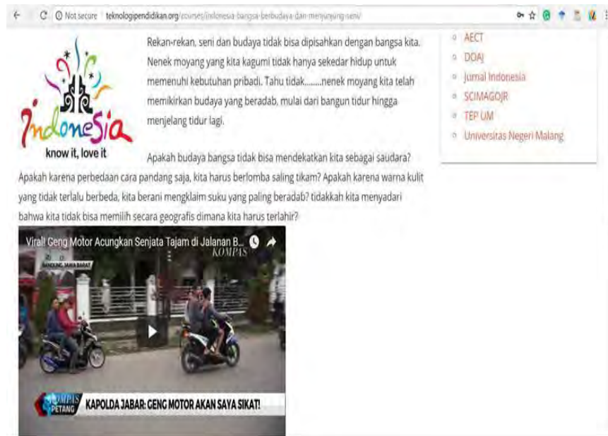
Figure 5 Strengthening Analysis