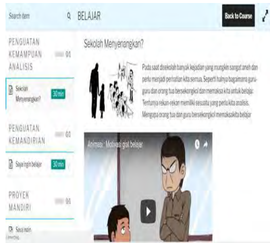
Figure 4 Development of LMS with segmented learning

Overview of learning in Figure 3 is used to motivate students and build an impression of analysis as a very important activity. Motivational activities are intended so that students have an independent learning approach and are grouped in using LMS in Educational Technology. The next activity is the activity of developing student behavior for individual development and developing collaborative behavior (Figure 4). Learning is done by giving segmentation so that partial giving remains in the corridor of learning as a whole.