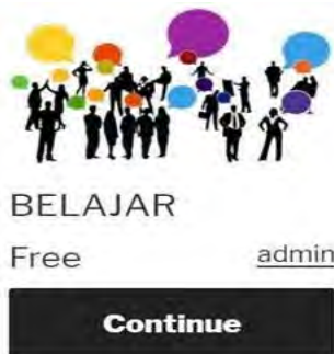
Figure 2 Learning Icon

In the initial view (figure 1) web development using rector building in Universitas Negeri Malang to give a character on this website is purely done by a team of researchers from the State University of Malang. The teacher has not been involved in the process of web development and content development. The design is carried out based on the development carried out jointly with the individual learning team of the main researchers and students of the Bachelor of Education in the State University of Malang. In the percentage of learning design, elements of individual and group strengthening are included. Technically, as shown in Figure 2, it is an icon as symbol to enter the LMS teknologipendidikan.hol.es system.