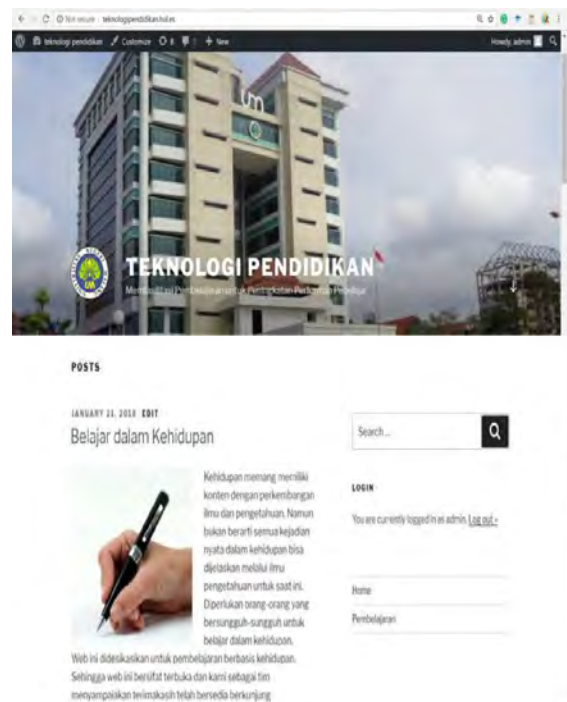
Figure 1 LMS technologyeducation.hol.es

Research has conducted analysis and development of learning models. The process of analysis is done to high school students as described by the analyst is the user and the media to produce a model and will have an impact on the design process only and does not affect the simultaneous design. The analysis process for Universitas Negeri Malang Laboratory High School students and their development design is not a sequential process. but the analysis process has an influence on the design process of AVOD development. Processes that are in the Design environment are simultaneously affected indirectly. The analysis process includes two steps, namely teacher analysis and student analysis. Learning resources that use learning media in the form of mobile gadget.