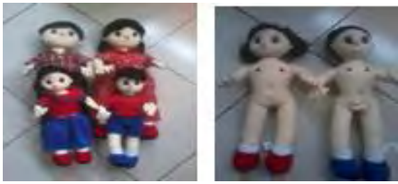
Figure 1 The Doll