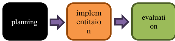
Figure 1. Learning concept

Learning planning includes the formulation of learning objectives. These learning objectives are translated into general instructional goals and specific instructional goals. Both are guidelines in implementing learning to be carried out. Implementation of this learning includes the design of instructional media, design models and appropriate learning methods. In the end, the final stage of the learning sequence is the evaluation of learning. Learning evaluation designs that are formulated appropriately will provide a comprehensive picture of the expected competencies.