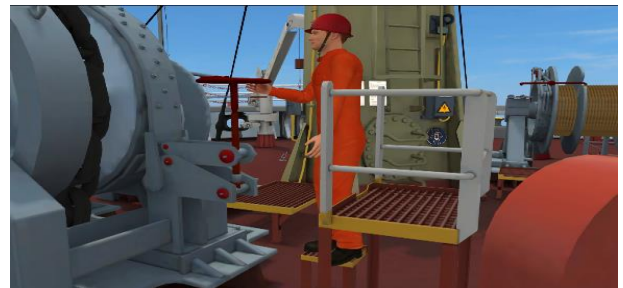
Fig. 4. Virtual proxy.

The 3D virtual ship simulation system is located in the training terminal and is the foundation of the whole training platform. The system can show the three-dimensional environment of the ship's three-dimensional hull, deck equipment, forecastle and bridge, dynamic and realistic in the scene (as can be seen in "Fig. 3"). Meanwhile it can realize the operation process and effect of main equipment, the operation process and effect are basically the same as the actual ship. Also, it can realize the coordinated inspection work of many PSCOs (as can be seen in "Fig. 4").