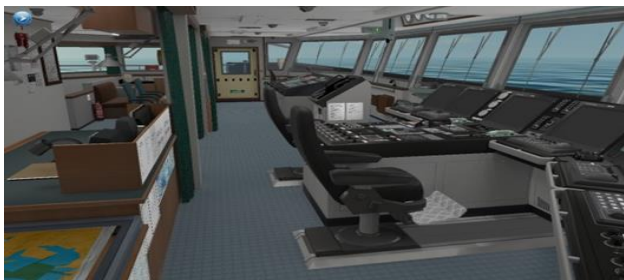
Fig. 3. A virtual scene in the bridge.