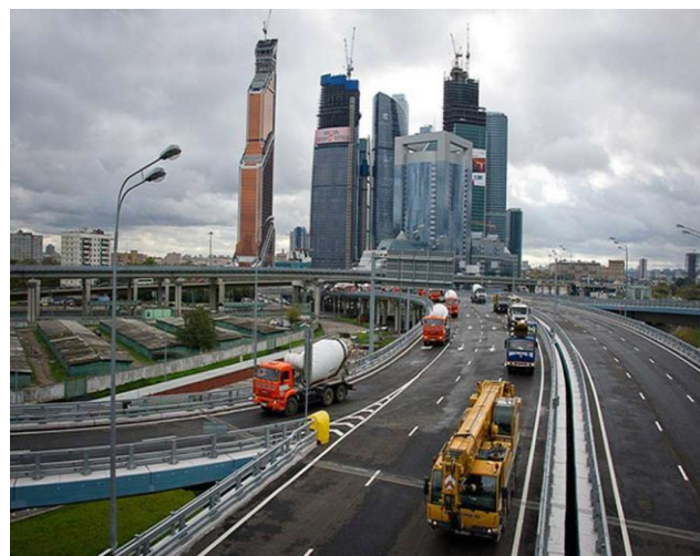
Fig 2. Development and growth of the city and transport system

The essence of this function is that the development and functioning of the urban transport system determines both the development and growth of the city and the distribution of economic objects and the population within the residential area (Fig.2).