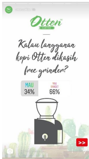
Fig 5. Question about the willingness to become a customer

the coffee mill is to re-emphasize that the substance of all these posts is about the coffee grinder can be seen in Fig 5.