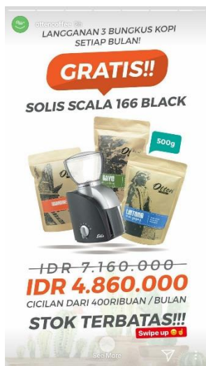
Fig 6. Promotions about attractive offers for viewers

At Fig 5 there is an invitation to become a customer of coffee beans sold by Otten Coffee with rewards in the form of a coffee grinder when accepting Otten Coffee's invitation. In this post, the viewer indirectly began to be enthusiastic about the offer given by Otten Coffee, seeing from the answer of the viewer who answered very much with the offer can be seen in Fig 6.