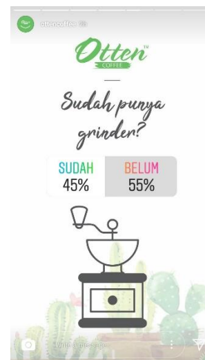
Fig 4. Questions about ownership of coffee grinders

At Fig 3 viewers are invited to learn about the tools used to grind coffee. However, the form of the message delivered is still in the form of a question about general knowledge which is about the choice between a manual grinder or an electric coffee grinder. In this post, the communicator starts to lead to a more specific domain, namely the coffee grinder can be seen in Fig 4.