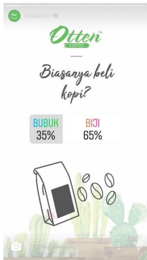
Fig 1. Questions about choosing Seeds or Powder

In March 2018, Otten Coffee posted pictures in the story feature, the contents of which contained questions to lead the reader to keep abreast of all the pictures he posted that day. In the post there are 2 components of communication simultaneously, namely written words (verbal) and pictures (non-verbal) and there is a method of delivering the message by using the storytelling method. The posting of Otten Coffee's instructor stories are as follows in Fig. 1.