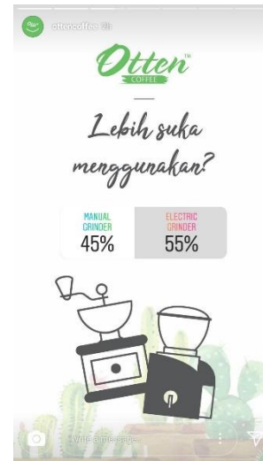
Fig 3. Questions about manual or electric grinder selection

At Fig 2 the question is still around the viewer's knowledge of coffee even deeper, namely the question about the taste of the viewer in the selection of coffee roasting he likes. The answer is also 2 choices between Light Roast and Medium Roast. Non-verbal messages on Fig. 3. This is an illustration of a roasting machine as a verbal message reinforcement containing about the choice of viewer roasting preferences.