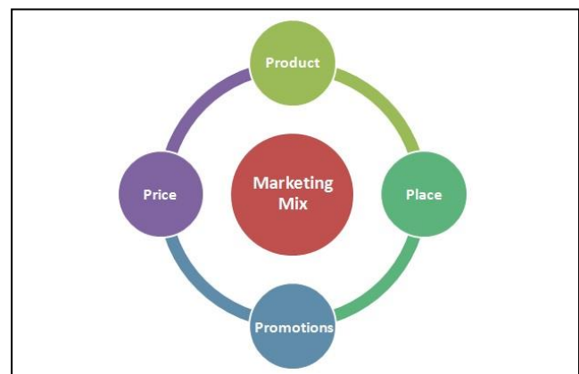
Fig. 1. Marketing Mix 4Ps Elements

Marketing mix means the product, distribution, promotion, and pricing strategies to produce and carry out exchanges and achieve the target markets [9]. Fig. 1 shows the elements of the marketing mix 4Ps.