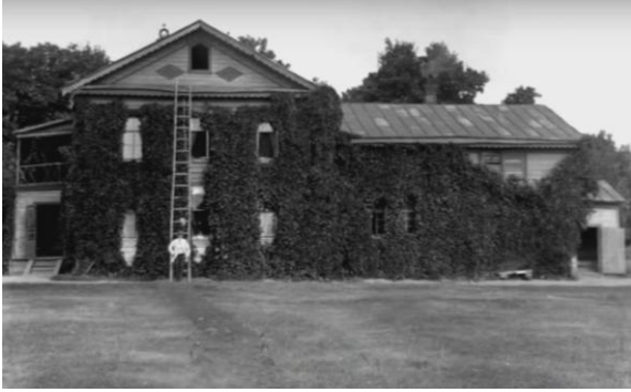
Figure 2. Photo of the of the of the Satins " Ivanovka" nobles estate outbuilding

As additional information photos [19, 20] are used, as an example in figure 2 the photo of an outbuilding is given..