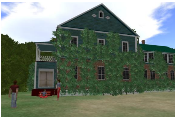
Figure 3. Visualization of the nobles Satins "Ivanovka" estate virtual model from the wing

In 3D-modeling programs (Google SketchUp, Blender) according to known parameters (size, material), three-dimensional 3D-models of estate objects (buildings, utensils, etc.) were built as existing objects, and lost or partially destroyed. Using landscape design programs (L3DT, Terragen) on the basis of available topographic information (maps, plans, diagrams, images from space), a 3D model of the landscape was designed. Based on the created 3D models of objects and landscape in the software system to create multi-user three-dimensional virtual worlds Open Simulator formed the final virtual space. The visitor of the Museum with the help of a specialized software client (Cool VL Viewer, Singularity) connects to the server via the Internet and controls the movement of the avatar (virtual visitor) inside the simulated virtual world. Figure 3 shows a separate fragment of the virtual Museum-from the side of the wing with three visitors from different countries of the world.