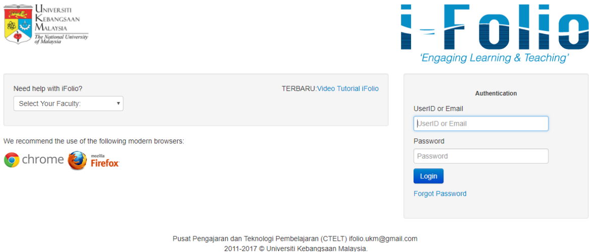
Figure 3. The I Folio Front Page

Generally, the Learning Management System (LMS) help the education institution in conducting learning process as well as adressing policy issue related to these fields. The Learning Management System (LMS) offers a variety of tools to provide a more effective course and is a great tool to streamline learning by leveraging the benefits of the Internet without neglecting the importance of a teaching staff. Nabil Azfar (2016).I Folio is one example of the Learning Management System (LMS) that has been used throughout the University of Malaysia (UKM) campus.It helps to facilitate student management, subjects each semester and helps lecturers manage the subjects offered each semester while also assessing students directly.