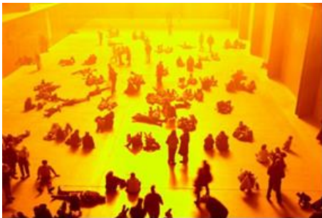
Fig. 2. Audience interaction.