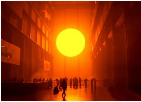
Fig. 1. The "Small Sun" installation.