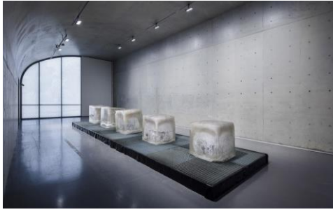
Fig. 4. The "Still River".