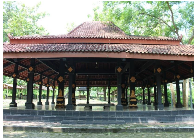
Fig. 3. Attraction facilities such as Pendopo Building

are usually conducted in the area behind the Kayangan Api tourist attraction, adjacent to the agricultural area. The area in its development planning will experience a change of location in accordance with the purpose of developing the area expansion. In addition, the historical and cultural context is an attraction in the Kayangan Api tourist area. These activities are generally spiritual facilities and a series of special activities related to traditions or processions with specific objectives. One of the tourist attractions in the form of a center of fire that is used by visitors, is the main media in the implementation of these spiritual activities. The relationship between physical and historical potential makes the main factor in the development of tourism, so it is necessary to optimize the utilization of these potentials.