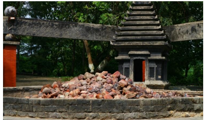
Fig. 2. Bursts of Natural Gas as a Result of Tectonic Activities in the Kayangan Api Tourism Area

phenomenon never goes out even in the rainy season so it is often called an eternal fire. This natural phenomenon is related to the geological conditions in the Kayangan Api area, where the condition of karst rock domination as the main constituent material in the region which then meets with tectonic activity in the form of plates and rocks in the form of faults is one of the factors in the emergence of natural gas [16].