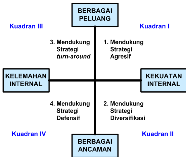
Fig. 1. Determination of development priority quadrants on IFAS & EFAS SWOT analysis methods [15]

The strategic decision making process is always related to the development of the company's mission, goals, strategies and policies. The results of the analysis are usually directions or recommendations to maintain strength and increase the benefits of the opportunities available, while reducing deficiencies and avoiding threats. If used correctly, a SWOT analysis will help us to see sides that have been forgotten or not seen so far [14].