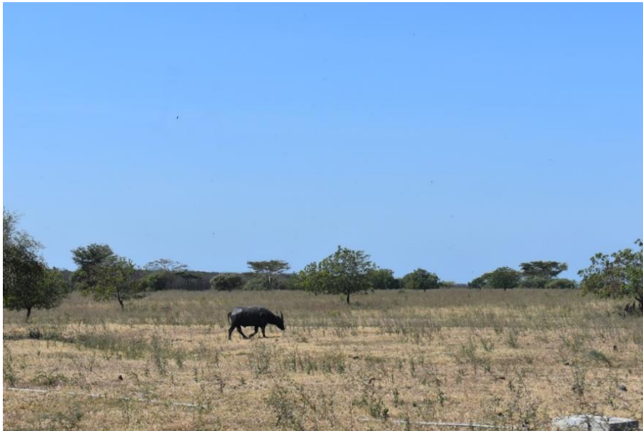
Fig 1. Wild Buffalo in Baluran National Park

Community involvement in management will have an impact on the sustainability of travel and their local economies [6]. To achieve this, the management of the Baluran National Park start limiting the number of tourists; tourists prohibited from staying in the park area. The rule resulted in forced travelers looking for lodging outside the park. This opportunity is then used by the local community to open a halfway house rental services.