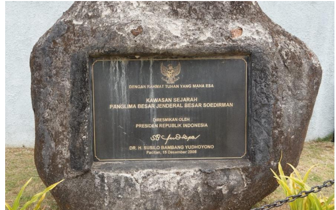
Fig 2. Symbol of Inaguration of the Monument by Mr. Presiden RI

The gate in the front area reads "" that the only national property rights of the republic that remain intact remain unchanged, even though they have to face all kinds of problems and changes are only the republican forces of the Republic of Indonesia (Indonesian National Armed Forces ". The writing is very printed and clear to be able to read if people pass the road, under the inscription on the gate there is a stone used as a symbol for the inauguration of this building. From the stone it can be seen that this building was inaugurated by the President of the Republic of Indonesia at that time, namely by Dr. H Bambang Susilo Bambang Yudhoyono precisely on December 15, 2008.