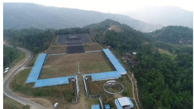
Fig 1. Jenderal Soedirman Monument Area, Nawangan Pacitan