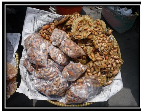
Picture 2 Jingking brittle

The potential of Gunung Kidul Regency in the culinary field is very diverse according to the characteristics of each region. In areas that produce a lot of fish such as Baron beach, Sadeng is often found simple food stalls that sell a variety of processed fish. In the Gunung Kidul region with low rainfall and rocky soil types, only rain-fed rice can flourish. Some of these rainfed rice types offer red rice with a unique taste, namely in the Semanu area. In Semanu, there is a food stall that serves as a special sego abang Gunung Kidul.