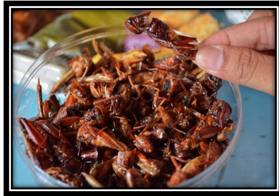
Picture 1 fried grasshopper