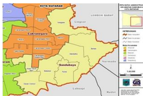
Figure 1. Map of Sandubaya District-Site of Sampling of Mosquito

Sandubaya is one of the sub-districts in the city of Mataram. Sandubaya District has an area of 10.32 km 2 with an astronomical location of 117 30 ' - 118 30' East Longitude and between 05 54 ' - 08 04' 'South Latitude. Sandubaya District in the south is bordered by Labuapi District in West Lombok and north is bordered by Cakranegara District, while in the west it is bordered by Mataram and Cakranegara District and