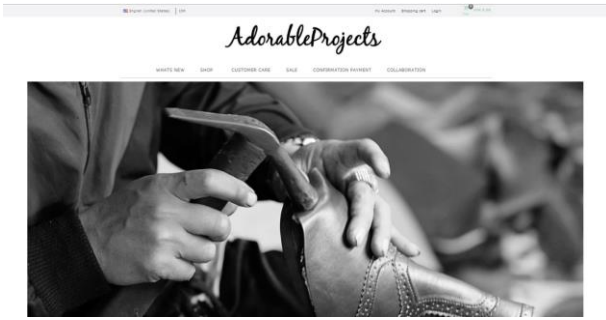
Fig. 1. Website of Adorable Projects, Source: Adorable Projects 2019.

According to the informant, the preparation of verbal and nonverbal messages on Facebook, before using communication media, first learn the ability of the type of media that will be used to produce reach, frequency, and impact. The use of communication media is very helpful for promotional activities, because with media can create awareness (awareness) consumers will know the existence of products and as a sign of sales promotion activities (interview with Ira Hanira, owner of Adorable Projects, May 3 2019). Adorable Projects actively informs its products on Facebook as follows.