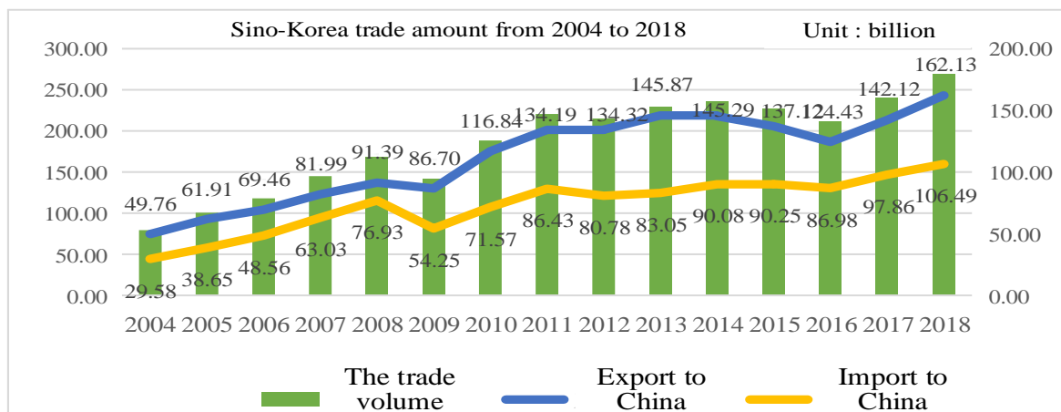
Fig.1 Sino-Korea trade amount from 2004 to 2018