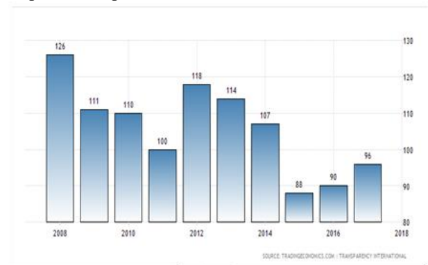
Fig. 1. Corruption perception index year 2008-2017.

Based on the Corruption Perception Index data published by Transparency International in 2017, it is revealed that Indonesia's corruption ranking is at the rank of 96 from 175 corruption countries. Since 1995-2017 the average of Indonesia has been ranked corruption on the rank of 100.09, the highest in the year 2007, the rank of 143 and the lowest in the year 1995, namely ranking 43. Here is figure 1 showing the Corruption Perception Index in 2008-2017: