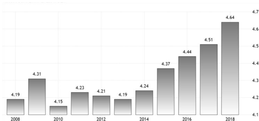
Figure 2. Russia Competitiveness Index 2007-2018.

According to the Global Innovation Index (GII), over the past six years, Russia has improved its performance, moving from 64th to 43rd position, ie, about 1.5 times. Almost the same picture can be seen in the Global Competitiveness Index (GCI), Russia scored 4.64 points out of 7 on the 2017-2018 Global Competitiveness Report (Figure 2).