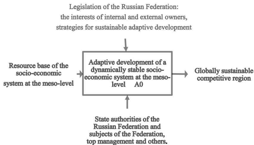
Figure 1. Process model of adaptation of the region, as meso-level socio-economic system.

Today allocate three the most often used notations when modeling business processes are BPMN, eEPC, IDEF [19]. The notation of IDEF0 for development of process model chosen by us allows to consider key processes of adaptation various-level socio-economic systems and also gives the chance of carrying out the further economic analysis on the basis of the developed model. The proposed model is based on the system-integration intentional-eventualized theory of enterprise proposed by corresponding member of RAS, Professor G. B. Kleiner. According to this theory, the enterprise is considered as a system, which analyzes the inner space of the enterprise comprehensively, its relationship with the external environment and the driving forces behind the functioning of the enterprise [20, p. 48]. In our case this theory will be applied relatively to meso-level socio-economic systems. In a general view the process model of adaptation of a regional socio-economic system can be presented graphically in the following way (Pic. 1).