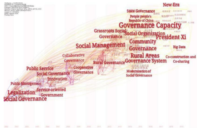
Fig. 2. Social governance research evolution graph.

The study of social governance can be said to be abundance. Combined with the previous literature review and knowledge map analysis, the Chinese research on social governance has the following four development trends: