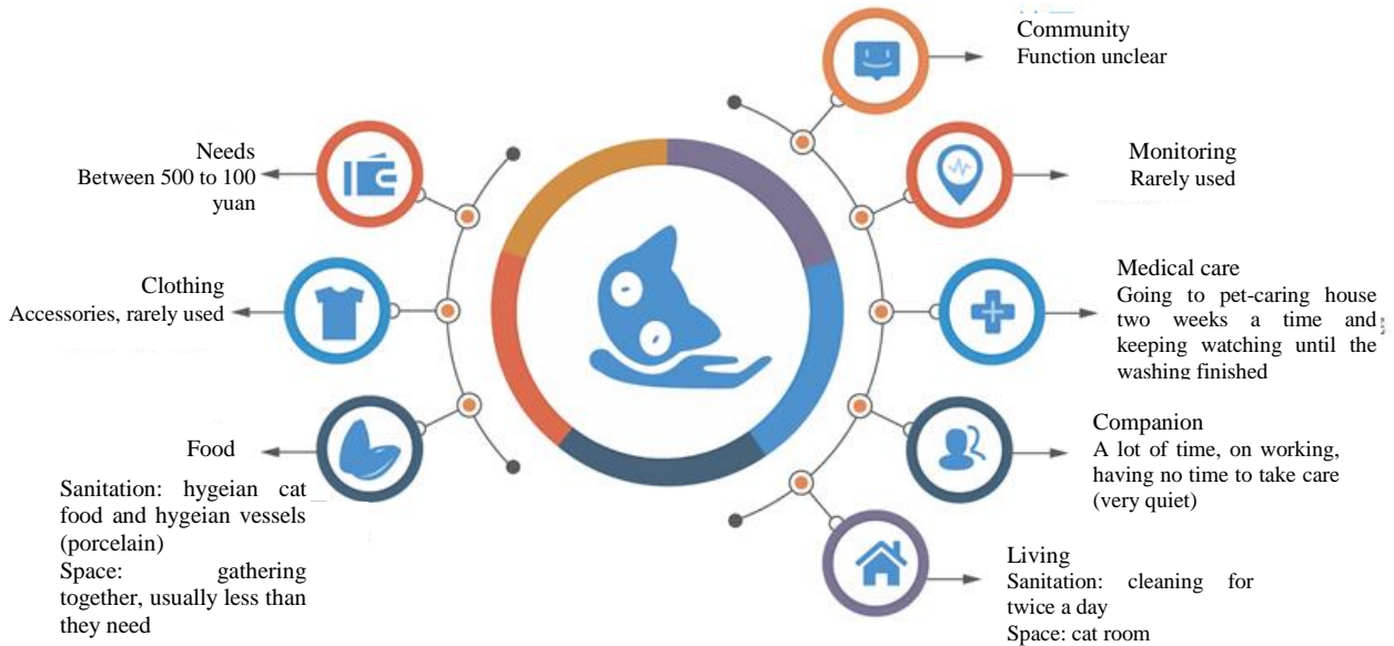
Fig. 2. Literature research & survey interview statistics.