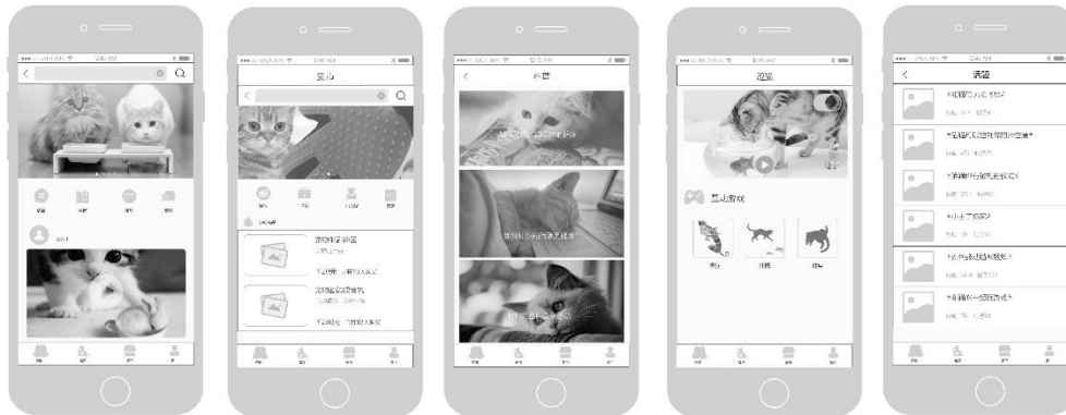
Fig. 5. Display of the main interface.

their own thoughts on the relevant prompt information, which shows that they do not want the forced-push messages [11], which requires the "playing with cats" applet to fully consider users' habits and preferences during the interaction design process. In order to facilitate users to buy daily supplies about cats, a cat market is set up in the applet. Users can see the latest cat breeding artifacts developed in the cat market, which can satisfy people's desire for interaction and socialization in many aspects. The "playing with cats" applet prototype design is shown in "Fig. 5".