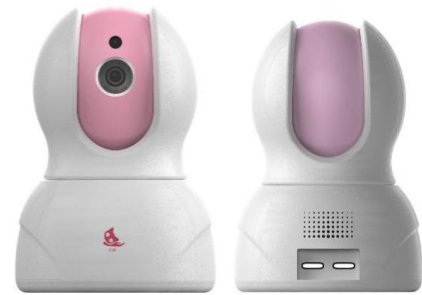
Fig. 3. "Paying with cats" robot design.

discover new product opportunities, and create product concepts and corresponding development mechanisms that meet consumer needs [9]. According to the above analysis of users, more user-oriented pet interactive entertainment system designs should consider office workers. Such users usually work hard and have no time to look at pet cats at home, but they are worried that pets are boring at home alone and eating irregular. Therefore, it is necessary to increase the communication between people and pets through the pet interactive intelligent system, and to remind pets to eat on time. In addition, the camera can be controlled by a mobile phone, and some small games can be set to attract the pet's attention. At the same time, the pets' physical fitness is also improved while the pets are playing. DM Go, a hardware product of "playing with cats" system, combines the functions of a camera and a projector. DM Go can be controlled and communicate with cats through small programs. DM Go adopts a sleek and smooth overall appearance. The angle rotation also highlights the cute and agile shape, which is conducive to recording the life of pet cats in all directions and achieving the function of remote interactive entertainment. The design of "playing with cats" hardware product DM Go is shown in "Fig. 3", and the internal structure design is shown in "Fig. 4".