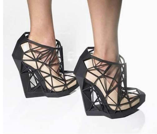
Fig. 4. 3D printed platform shoes.

With the globalization of information today, being able to use the Internet to customize designs and services that meet individual needs will also become an inevitable development trend of the times. This form can not only meet the needs of consumers, but also allow consumers to participate in all aspects of conception, design and production. In the end, a unique and personalized customized product is formed. This is the research and development process of personalized product.