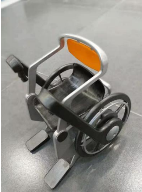
Fig. 2. 3D printed wheel chair.