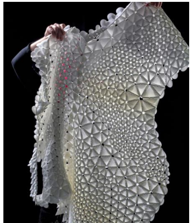
Fig. 1. 3D printed fabric.

Moreover on the basis of providing practical functions, the product can combine a variety of design elements to better decorate the product shape and make the product having more aesthetic value. With the continuous development of 3D printing technology, a variety of composite materials and metal materials have emerged endlessly so that the appearance of products shows more combinations of comprehensive materials and more decorative possibilities, which adds aesthetics, artistry, and fun, story and thought to the product design. So 3D printing makes product modeling and decoration more diverse ("Fig. 1" and "Fig. 2").