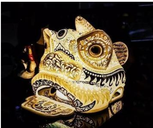
Fig. 3. 3D printed intangible heritage "Lingnan lion (岭南醒狮)".

3D printing makes product design available to show multiple functions, highlights the essence of creativity and personalization, and can better meet the cultural and psychological needs of individuals in addition to functions, so that personalized products can meet both actual needs and emotional needs; and the emotional design can maximize people's satisfaction and joy, and even forms beautiful memories. Just as many products are rustic and mundane in the eyes of young people; but in the eyes of some specific people, the products can evoke their deep inner memories. This is the cultural value of personalized products ("Fig. 3" and "Fig. 4").