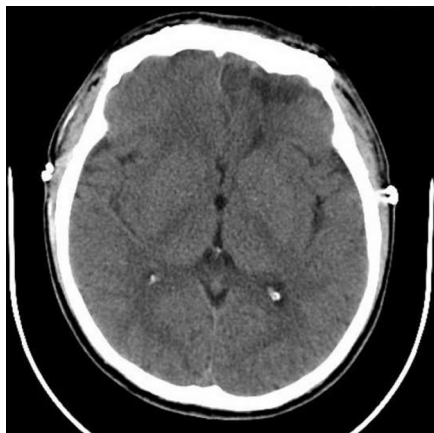
Figure 2 | Complete resolution of the pneumocephalus with small air foci noted in the right frontal horn of the lateral ventricle.

and recanalization of the frontal sinus. Postoperatively, he had an uneventful smooth recovery with rapid resolution of his headache. A repeat CAT scan of the brain was obtained and showed complete resolution of the PNC with small air foci noted in the right frontal horn of the lateral ventricle (Figure 2). On the 11th postoperative day, the patient was discharged home symptom-free.