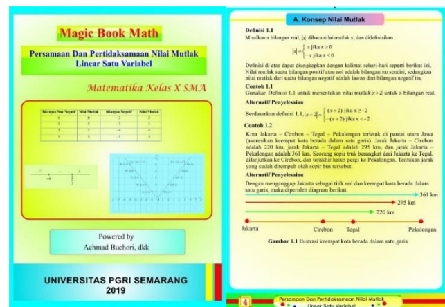
Figure 1 Magic Book Math Display

At this stage, the researcher designed the product to be developed based on the results of the analysis that has been done. From this research, an android-based learning media was produced using Augmented Reality called the Magic Book Math based on augmented reality. The material in this media was class X mathematical material consisting of Equations and Inequalities of Absolute One-Variable Linear Value, Rational and Irrational Equations and Inequalities, One-Variable Linear Equation System, Dimension Three. Display Magic Book Math for the Equation and Inequality of Absolute Linear Values of One Variable can be seen in the following image.