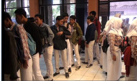
Fig. 3. The crowd in queue.