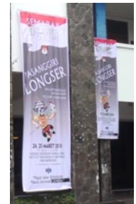
Fig. 2. Poster of Pasanggiri Longser .

There are twelve groups are registered to perform in this Pasanggiri Longser . However, on the day there are eleven groups joining the Longser competition or in Sundanese term, Pasanggiri Longser . The twelve groups are Bandoeng Mooi Kota Cimahi, Ngaparak Teater Rancaekek Kab. Bandung, Komunitas Posteatron Kab. Garut, Geng Longser Cicalengka Kab. Bandung, Longser Bojegan ETPIS Kota Bandung, Longser Injuk Kota Bandung, Longser Famor Baleendah Kab. Bandung, Kabayan Kang (Polban) Kab. Bandung Barat, Longser Application Kota Bandung, Longser Toonel Kota Bandung, Longser Campernik Kota Cimahi, and Longser Kujang Siliwangi Kab. Bandung Barat. However, the names of the groups joining Pasanggiri Longser cannot be found on the posters or the logos in the posters. The logos in the posters are all about the tagline of KPU “Pilgub Jabar SEMARAK, Pilkada Serentak GEMBIRA”. This is the party of KPU tagline under Pasanggiri Longser . It is not easy to not see the KPU tagline in the posters (see fig. 2).