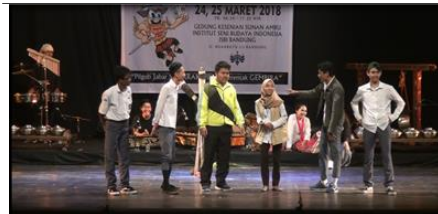
Fig. 4. Intimate and cheerful.