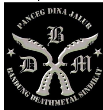
Fig. 1. Jargon and logo.