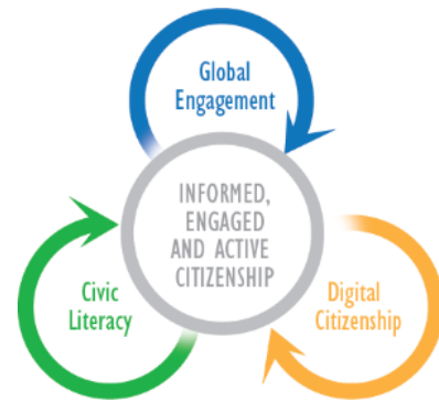
Figure 1 Citizenship Education the 21 st Century.

Teaching citizenship and citizenship competencies is framed by active citizenship in a national and/ or European context, namely by explaining political rationality and discursive practices that underlie the teaching assumptions of citizenship competence, [10]. Changes and developments in society, students must be equipped through citizenship education with new knowledge to acquire attitudes and skills that enable them to actively contribute to the community and conceptual framework of citizen education in the 21st century, the first dimension is information that refers to new skills for access, evaluate and regulate information in a digital environment, the second dimension is Communication which not only refers to social interaction but also effective communication and collaboration and virtual interaction, the third dimension is Ethical and Social Interaction which refers to social responsibility and how one's actions affect community, so the impact is being a digital society, Ananiadou & Claro (2009) in the results of [11].