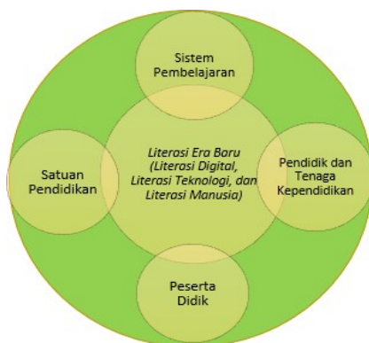
Figure 3: Chronosystem of Vocational Era of Industrial Education 4.0.

Three citizenship competencies are components that cannot be separated from each citizen, so they can create a good country. Global citizenship education is important to reflect constructively about the values, assumptions, and strategies of key actors who aim to provide answers to fundamental questions about the nature, purpose, and application of education for a variety of contexts, needs, and conditions for local education, [25]. With the rapid development of technology, we cannot leave our identity as a reference in life. People must be educated in all forms of contemporary mediated expression and far beyond print media, the importance of media education for citizenship teaching and social studies and examining approaches to citizenship through media literacy, one of which is the website, [26]. Elements that exist in vocational education as part of the chronosystem must strengthen the new literacy movement (digital literacy, technology literacy, and human literacy). Strengthening was carried out to provide added value and competitiveness of graduates of vocational education in the industrial era 4.0. Interaction and integration between departments with industrial content 4.0, [23]. Can be seen the picture below: