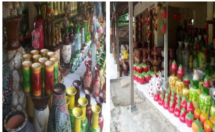
Figure 1: Various Types of Plered Ceramics Products

The types of products marketed include jars, household appliances, piggy banks, flower vases, with attractive colors as shown in the picture below: