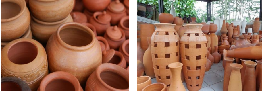
Figure 2: Ceramic clay types

The orders are mostly from the use of digital media channels which can lead to communication processes in marketing ceramic products, although not all Ceramic SMEs entrepreneurs utilize digital communication channels, because they tend to market personally and are direct in nature.