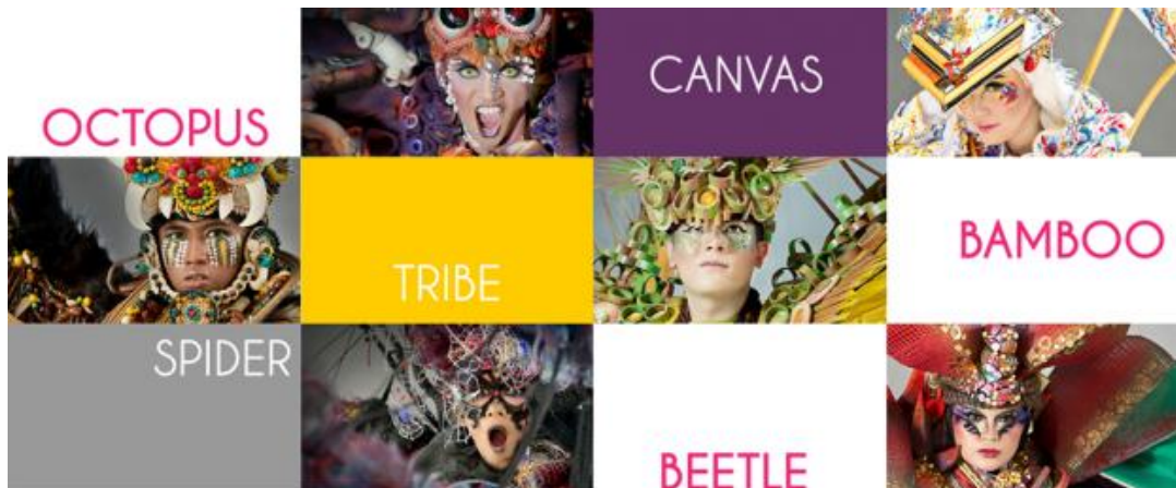
Fig. 3 Themes in JFC to 12 of 2013