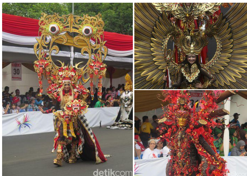
Fig. 4 Some of the best costumes in JFC 2016