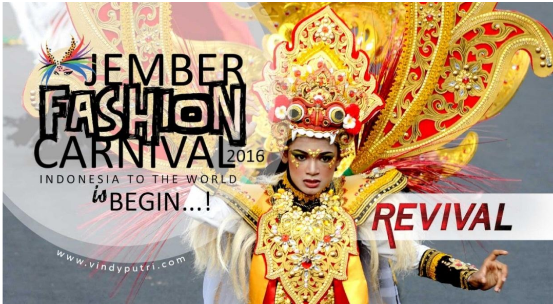
Fig. 2 “Revival” selected as JFC 2016 theme.