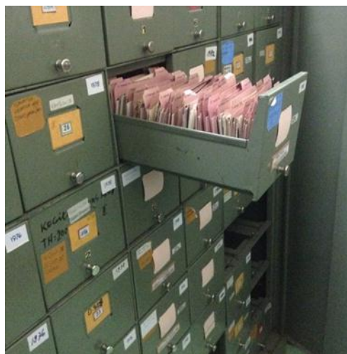
Figure 1. Photograph archive in filing cabinet

The photographic archive of Dispusip Jakarta is on the first floor in a special room for photograph archives. The photographs are stored in envelopes where one envelope could contain one photo but there are also many photos. As can be seen in Figure 1, the envelopes containing the archive photographs are stored in the the filing cabinet.