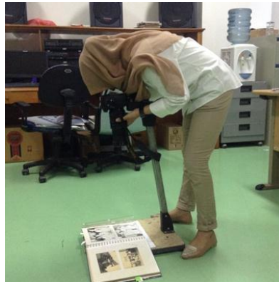
Figure 2. Re-photography

Digitization activity in Dispusip was last done in 2015. There are four archivists in charge of conserving archives. The digitization process of photographs that Dispusip have carried out entailed rephotographing using a DSLR camera. In Figure 2 an archivist can be seen doing a rephotograph using a DSLR camera and other assistive devices. The DSLR camera equipment is used for the digitization process because Dispusip does not have a special scanner to digitize the photograph archive. Existing scanners are used for digitizing paper archives. In addition, DSLR cameras are considered simpler to use and not directly in contact with the photograph.