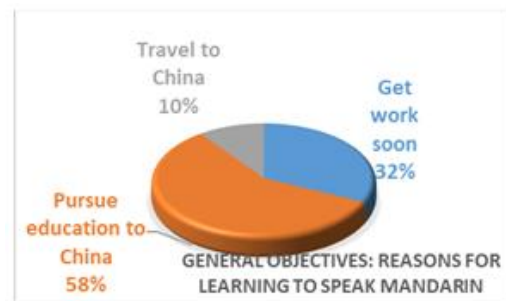
Fig. 1. Diagram of general objectives, reasons for learning speak Mandarin.

The results of the questionnaire analysis of the students' needs demonstrated several points. Generally, the students also preferred everyday life topics. However, their preferred topics were not matched with their abilities. They were found to be more interested in topics about applying for work, discussing messages and morals, and job interviews. Even though the lecturer strongly agreed that the learning materials should be based on the students' needs, they must be suited with the level of proficiency of the students. This is indeed very much in accordance with the diagram below.