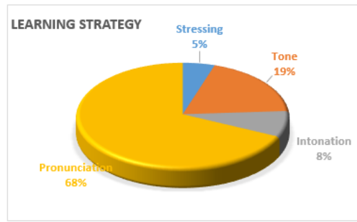
Fig. 5. Learning strategy.

The preferred learning strategy among the students can be seen as follows.