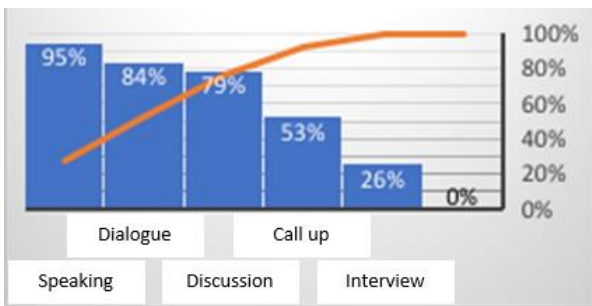
Fig. 4. Learning materials needed by students.

The learning materials can be seen as follows.