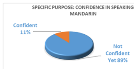
Fig. 2. Diagram of confidency in speaking Mandarin.

Because as many as 79% of the students have never learned to speak Mandarin before and only 21% have learned to speak Mandarin when they were at the senior high school level, it would be better for the students to start from simple topics considering the majority of their proficiency levels, so that they could absorb the materials well.