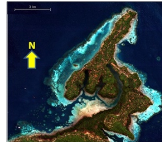
Figure 1 Research Site map

As a result of classification, seven geomorphology zones were distinguished including land, deep sea, reef crest, reef slope, reef flat and lagoon (Figure 2). The output of the image is a thematic map that accurately results in the classification process without errors or bias [11]. There are a number of equations that can show the level of error statistically, such as producer accuracy, user accuracy, overall accuracy and Kappa which can be calculated using the confusion matrix [17].