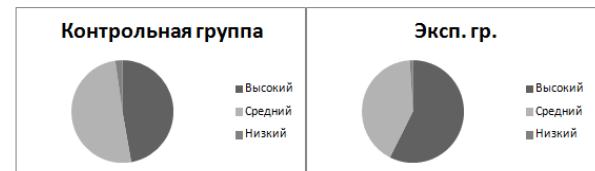
Figure 4 The level of development of musical and creative abilities of children of preschool age (final measurement)