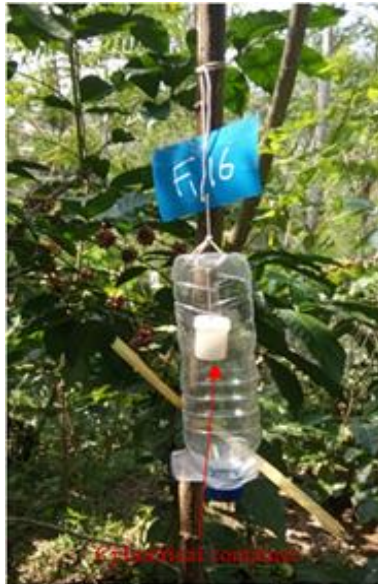
Figure 1 Bottle trap for catching CBB

The rest of the paper is organized as follows. Section 2 introduces the experiment result and discussion, while the last session presents conclusion of the paper and direction for the future research.