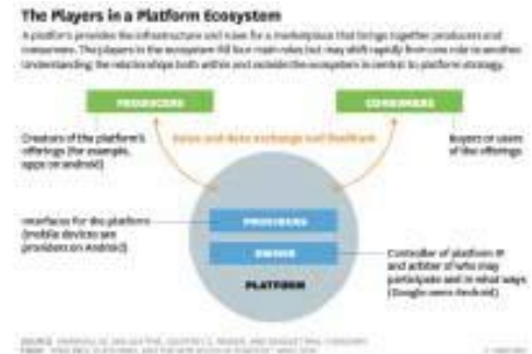
Figure 2. Two-sided Platform [18]

Broadly speaking, a two-sided platform exists when two sets of agents interact through an intermediary or platform, and the decisions of each set of agents affects the outcomes of the other set of agents, typically through an externality, [18] whereas the intermediary is more efficient in organizing the interaction.