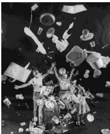
Pic 1 - Throwaway Living Campaign Thanks to Disposable Plastics in 1955.