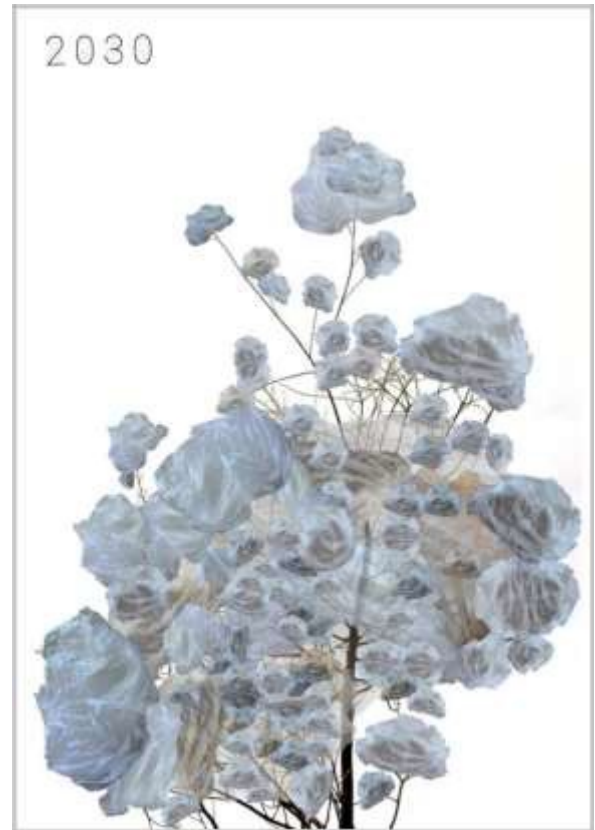
Pic 6 – 2030. By: Phebe Priska Dewi.

Many of the results of poster design workshops are interesting, with four classifications of plastic problems there are several visual approaches: the future and the present, parodies and threats. Both the four context approaches are carried out with various approaches to ideas and contexts. And these are the results of the four poster designs are followed by behind-thinking explanations from each poster.