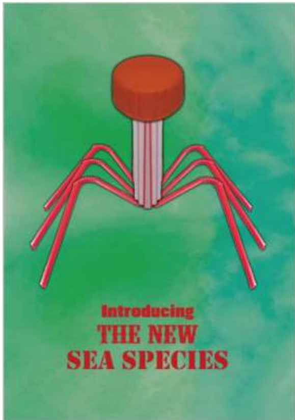
Pic 7 – New Sea Species. By: Vania Gabriella Nuralim.

In the present category, student named Vania Gabriella Nuralim; explained a unique finding but also sad at the same time. A new marine species! Where is visualized in the form of a dirty virus; from the combination of the background texture. Like a virus, this new species is not easily killed, it can even be said to not die; he will always live in the usual form, not decomposed by time. Its small size on a micro scale also makes it a great explorer, he will always be in nature and maybe already in our bodies.