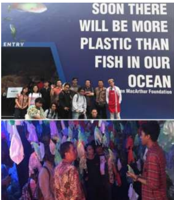
Pic 4 - Stop Plastic Use Campaign. By: KFC, Diving Club Indonesia, and MacArthur Foundation.

All of these things need to be realized really, that the use of these easy-to-decompose easy goods is the beginning of our food consumption chain as well. Various plastics which have been consumed by marine animals are part of their undigested body.