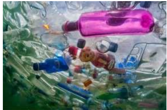
Pic 2 - Plastic Bottles Choke in the Oceans.

Most are not thrown from the ship, but are intentionally dumped carelessly on land or in rivers in most parts of Asia. This terrible problem also occurs in Indonesia [3]; which is the second largest producer of plastic waste after China, it is estimated that 3.22 million metric tons of plastic waste are dumped every year into the sea around Indonesia, from a total of 8.82 million metric tons of other country's plastic waste that also goes into the sea. The plastic waste crisis is not only limited to the ocean, but also affects the Indonesian river. Data from Nature Communications revealed that four rivers in Indonesia - Brantas, Solo, Serayu and Progo - were among the 20 most polluted rivers in the world.