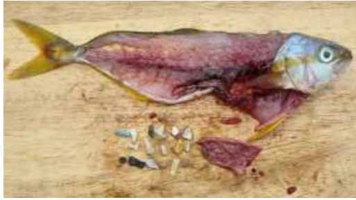
Pic 3 - Fish That Had Ingested 18 Pieces of Plastic. By: Marcus Eriksen.

All of these things need to be realized really, that the use of these easy-to-decompose easy goods is the beginning of our food consumption chain as well. Various plastics which have been consumed by marine animals are part of their undigested body.