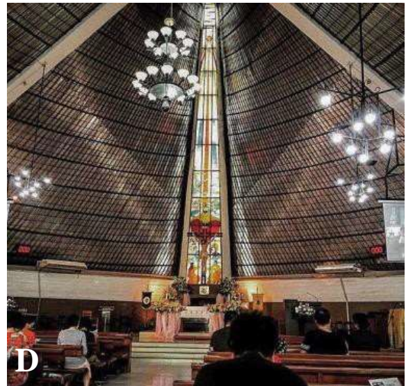
(A) Location of Kristoforus Church; (B) The outside view of Kristoforus Church; (C) The interior of Kristoforus Church; (D) Natural lighting in altar.