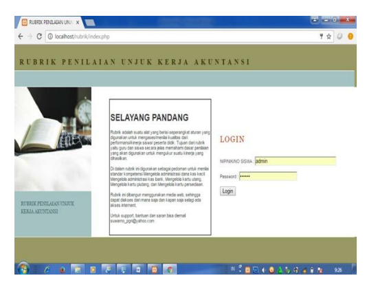
Figure 1. Login Page for Administrators

The Web page that had been developed are as follows. Login page is the initial page that will be used for authenticating the user before he or she fully accesses the website of accounting competence performance assessment rubric. The login page is intended for administrators is shown at Figure 1.