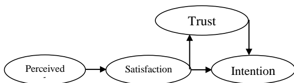
Fig. 1 National Consumer Intention Index

Satisfaction, Trust, and Intention. It has been explained above that satisfaction is the basis for the formation of trust in a product, and satisfaction also affects the intention to purchase a product. Meanwhile, it has also been explained that trust is a positive predictor of the intention to purchase a product. Thus, trust serves to mediate the relationship between satisfaction and the intention to purchase a product. Trust is a positive predictor of intention. In addition, satisfaction is a positive predictor of trust and intention. Based on this framework, the fifth hypothesis (H 5 ) can be formulated that the relationship between satisfaction and intention is mediated by trust. These five hypotheses will be tested simultaneously by using SEM (Structural Equation Model) with the structural model presented in Figure 1.