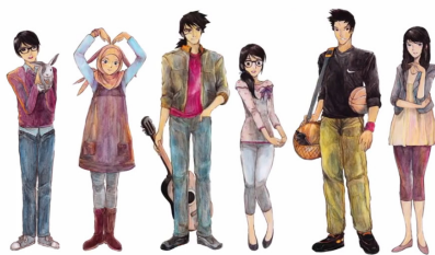
Figure 3 Characters in Comics Grey & Jingga