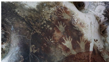
Figure 1 Mural Leang Petta Kere, Maros Sulawesi Selatan

Writings or paintings on wall have been around for thousands of years and serve different functions in each era. Paintings on wall in Leang Petta Kere Maros South Sulawesi, was estimated to have been made 39.900 years ago [1]. Today, looking at cave painting in Petta Kere is to imagine the past but when it was made perhaps to mark an existence of a tribe or to educate generation about their surroundings.