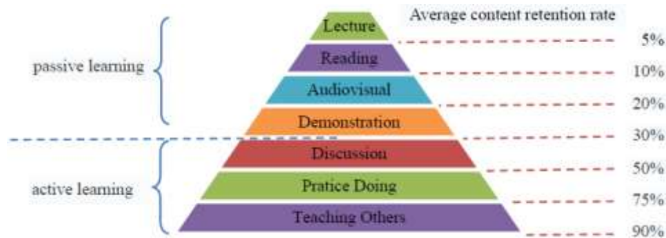
Figure 2 Edgar Dale’s learning pyramid model