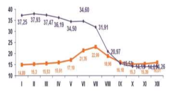
Fig. 2. Average prices of potatoes by months: – producer price; – consumer price

September. In early August, products of early potatoes of domestic origin appear on the market. But already from the spring early production from abroad arrives at prices that are 2–4 times higher than old potatoes. She holds until September – October. At this time, the market has the lowest prices.