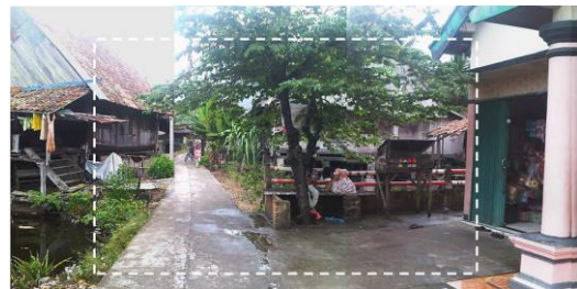
Figure 4 Sample of unplanned nodes.

Nodes are the space where people meet and gather with other people. The small numbers of people who are passing by and gathering in the public space cause the absence of nodes around the main corridor. Visual data search shows that there are a few unplanned gathering places. One of them is part of the house courtyard that is right next to the main corridor. It is an open area with a wooden bench where the children like to play.