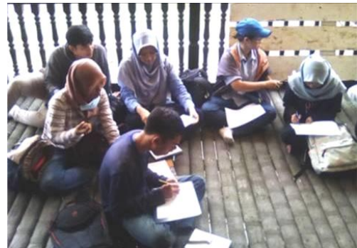
Figure 2 Process of moving a mental map into paper media.

This study combines three analysis methods, namely: descriptive method, graphical method, and quantitative analysis, to combine a lot of mental maps into a variable map. It aims to determine the role of architectural elements as a place identity in village space. Referring to the Purwanto and Darmawan work steps [3] to over-lay, the sketch graphic data was made by the respondents. Mental map sketches were collected from respondents of Architecture students who were conducting field studies at the research location. The information presented in the map sketch was combined quantitatively into a tabular form for analysis.