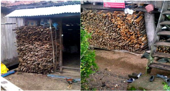
Figure 6 Mounds of firewood and potential as placemarks.

A kind of another object which is not an architectural element, but is quite scattered and easily seen along the village corridor are the mounds of firewood under the front of the house. The objects are easily seen by people, but they are not stored in the observers' minds. Maybe it is caused the objects is not an architectural object. A better layout and ordering these objects will be an effective placemark.