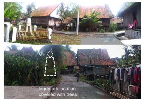
Figure 5 A monument as landmark obscured by trees.

There is a monument that can function as a landmark. The combination of mass form and its location in the t-junction of the village entrance corridor and the main corridor supposed to make it a clear landmark. Unfortunately, the monument covered with trees, so it would not be perceived by observers.