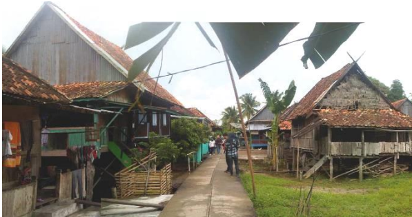
Figure 1 Main corridor and row of settlements in Menanga Village.

The Menanga traditional village is a settlement that was built linearly with the Komering river flow. Menanga Village has the main pedestrian lane in the village core walled by the row of traditional houses [4]. The traditional Menanga house is called Rumah Ulu [5], which has a unique architectural form that attracts people to see, observe, and remember.